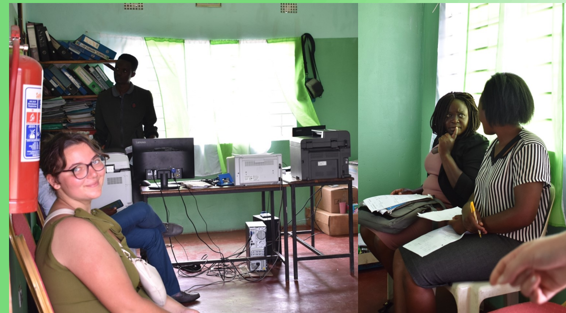
Some of the staff members in the office waiting for the management meeting . Every Monday we meet to give reports of our previous week activities and plan for the next week.