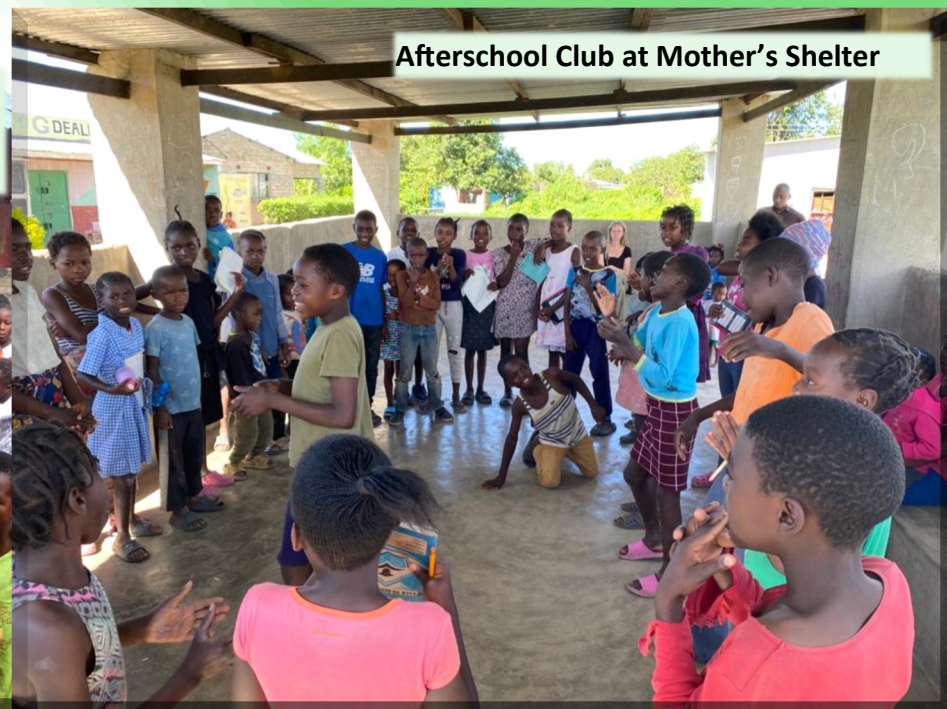
Afterschool Club at Mother's Shelter