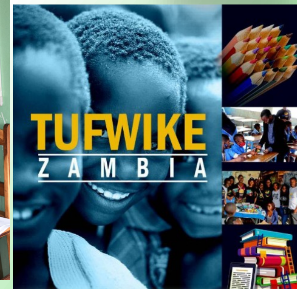
We are glad to have our new partner Tufwike Zambia an organisation that is providing clothing and school materials to the orphans and street kids, looking forward to work with them in some projects.