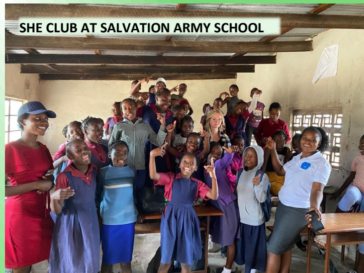
SHE CLUB AT SALVATION ARMY SCHOOL