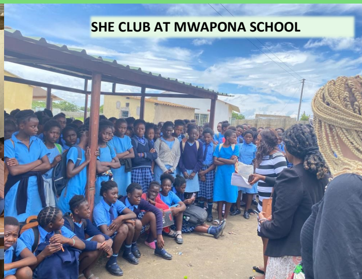
SHE CLUB AT MWAPONA SCHOOL