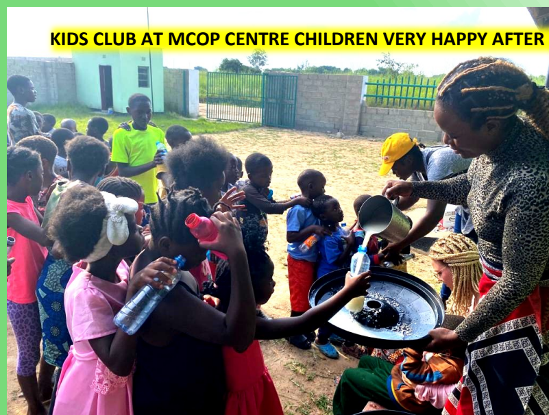
KIDS CLUB AT MCOP CENTRE CHILDREN VERY HAPPY AFTER RECEIVING SNACKS & TRADITIONAL JUICE