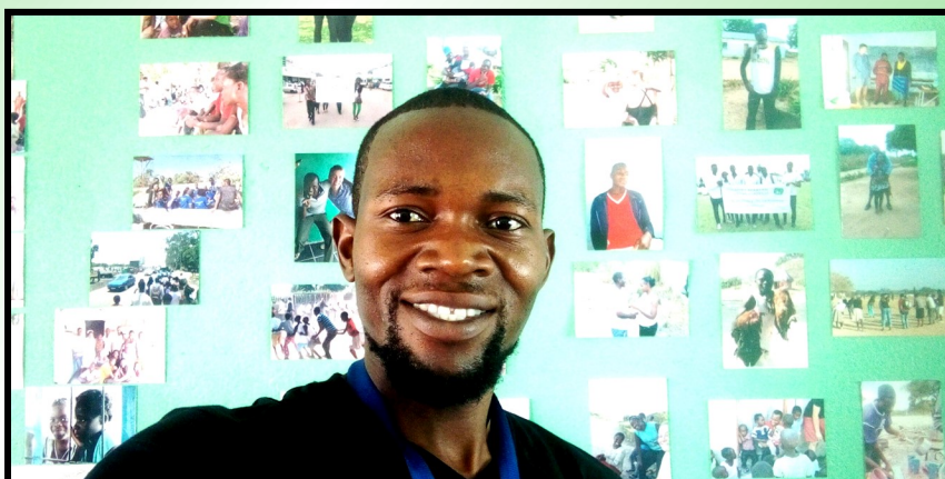
Our Picture wall in the office tells of a thousand stories of Mmabana past events . Always inspiring !