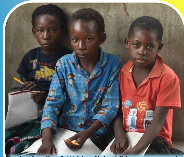
During Reading & Writing Club, children concentrating on learning literacy how to read and write.

Our first youth club in 2023, we had facilitations by Adaptive Leadership Zambia who are now our partners and we appreciate then for empowering our youths with HIV/AIDS awareness. This year we are looking forward to have many youth empowerment programs such as youth camps, ventures and youth nights.