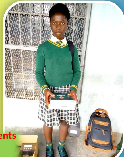
Children receiving school requirements getting ready for school!